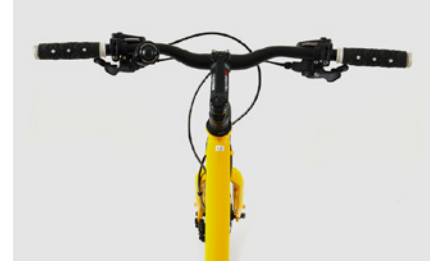
3. handlebar view from above