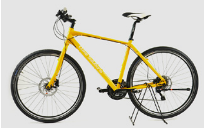
1. general view from left