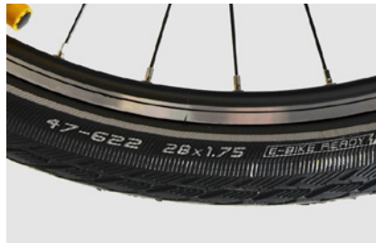
5. tire with sizes