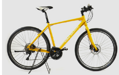
2. general view from right