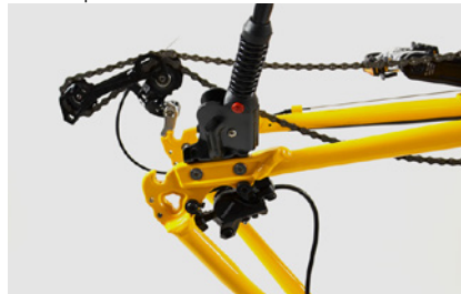
8. dropout without wheel