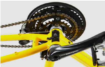
7. bottom bracket from the side